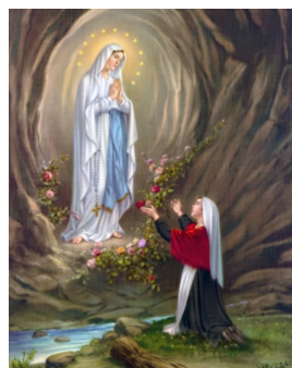
Our Lady of Lourdes